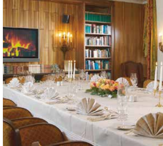
„Bibliothek“ 45 m 2