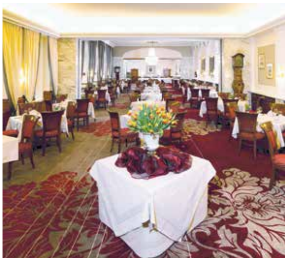
„Festsaal“ 235 m 2 - divisible in 3 parts