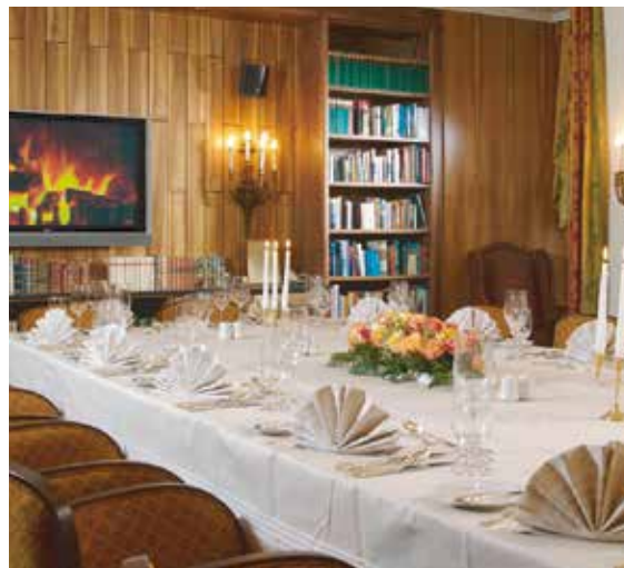
„Bibliothek“ 45 m 2